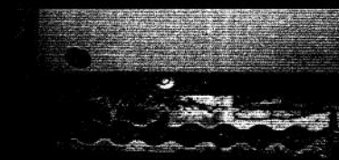
Example of seat track corrosion