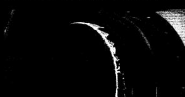
345 Speed tape for engine protection