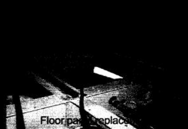
Floor panel replacement